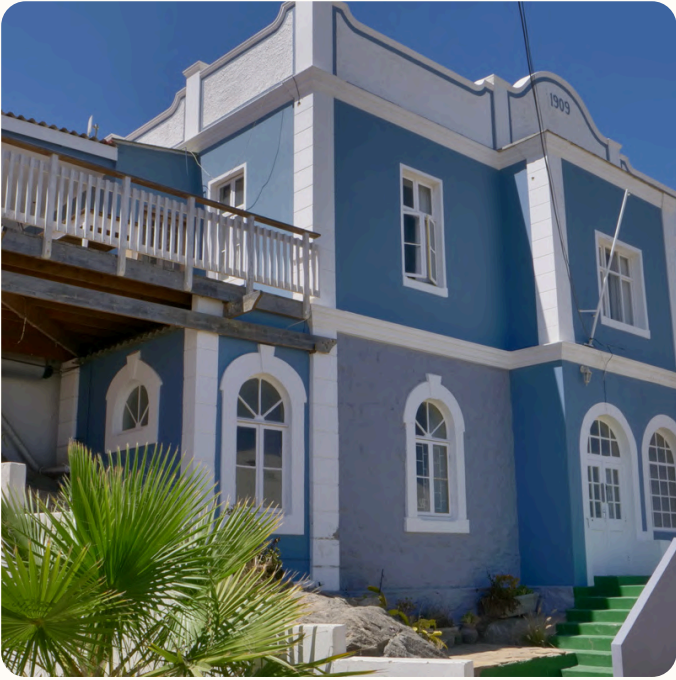
THE BLUE HOUSE