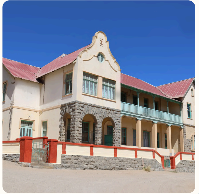
THE MOON HOUSE

Visiting school groups stay in one of our iconic boarding houses for their two-week biodiversity camp. Both buildings are located in the centre of town, with local shops, cafes and restaurants within walking distance. Students sleep in boys/girls' dorms with separate rooms available for accompanying staff.